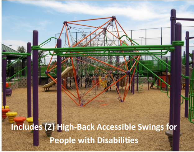
Includes (2) High-Back Accessible Swings for People with Disabilities